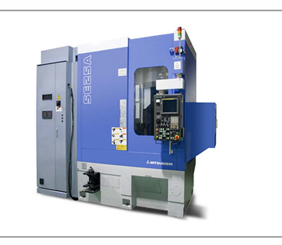
Mitsubishi ST25 CNC Gear Shaper