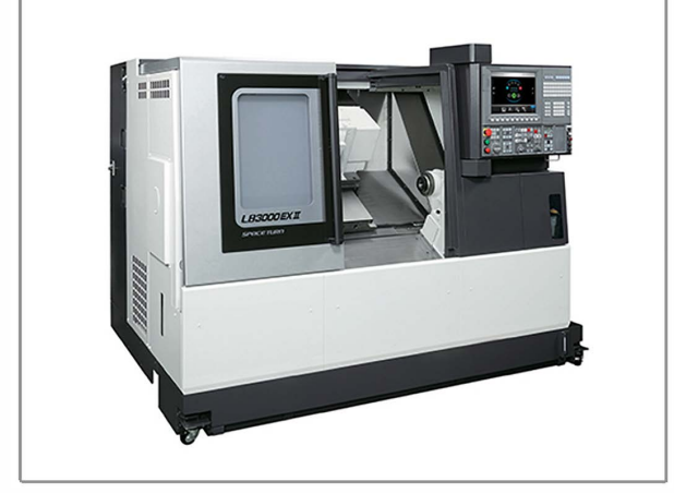
Okuma LB3000 EX II CNC Lathes (2)